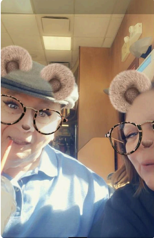
Thank you for the best years of my life.